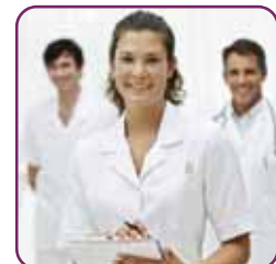
Protection in a recession