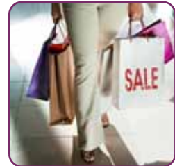
Shopping can help!