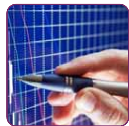
Turning a loss ...