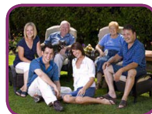
Who needs a will? (revised rules from 2009)