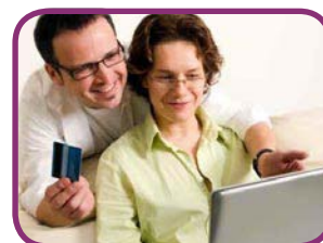
Back Page briefing: Beware online banking