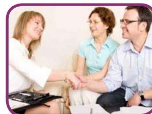
Active vs. passive investing